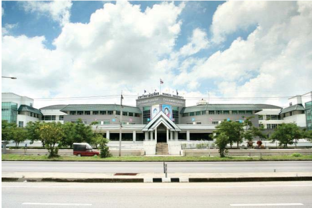
Golden jubilee Medical Center, Mahidol University Scope of service : CM Year : 2000 - 2006